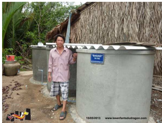
Type of water tank installed, with one of the 10th happy family to benefit from it.