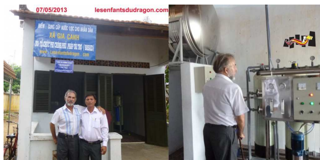
3 rd drinking water treatment station for a school of 600 pupils