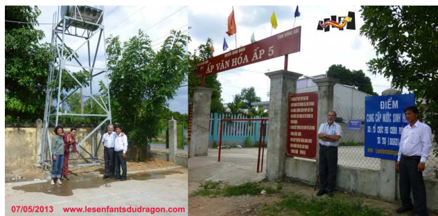
Driling of a wells in granit roch for village #5