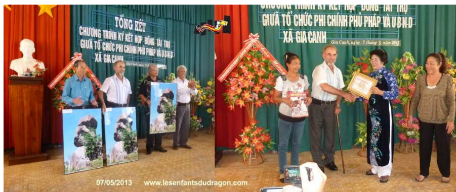
The official ceremony